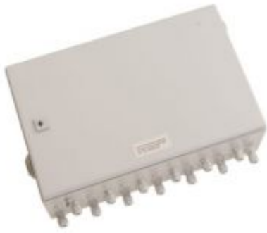
Module Cabinet MC-308