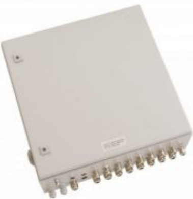
Module Cabinet MC-312