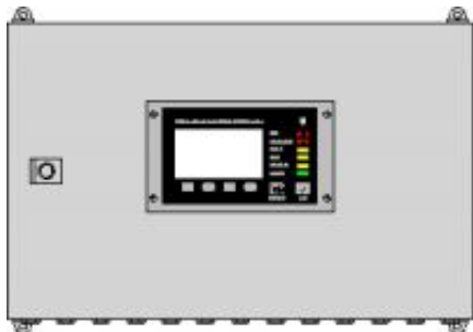
CP-100 in Module Cabinet MC-308