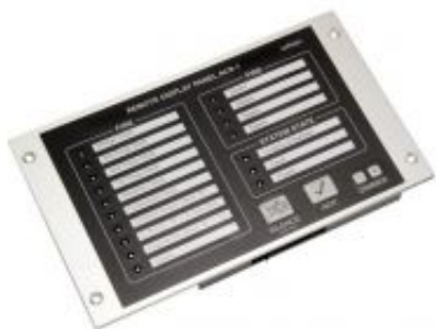
Remote Display Panel for ACS-1-FD